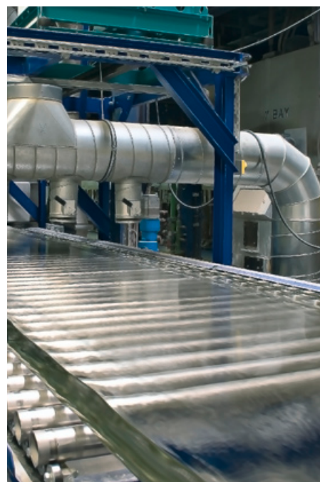
SUPREMAX ® 33 is available in large sheet sizes

SUPREMAX ® 33 is environmentally friendly and made of non-hazardous inorganic and natural raw materials. The glass can be recycled several times and disposed of without difficulties.