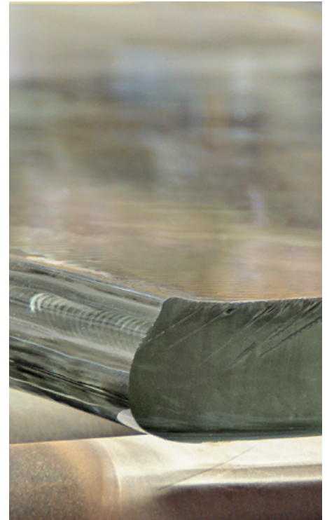
SUPREMAX® 33 ultra thick borosilicate glass